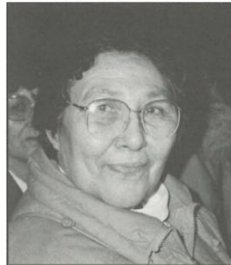
Enooya Enook Baffin Island