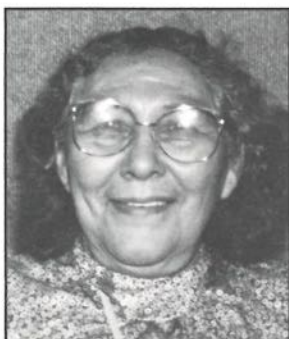
Enooya Enook / Baffin

\Delta f^a \quad \Delta f^b \quad / \quad \varphi^a \zeta^b \lambda^c