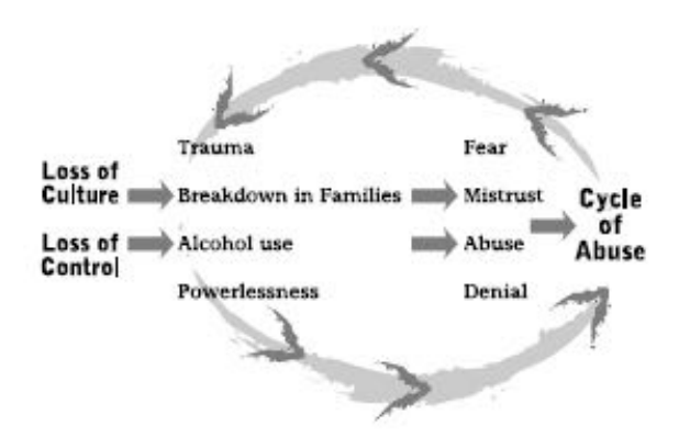
FIGURE 2: CAUSES OF ABUSE IN INUIT COMMUNITIES

There is a need to prioritize the issue of abuse within Inuit communities, to raise awareness and reduce the tolerance of abuse, to invest in training and capacity, to deliver services that heal Inuit, and to expand programs that build Inuit strengths and prevent abuse. As such, the strategy recognizes the need for sustained relationships among partner organizations, a coordinated effort to ensure resources are used to their best advantage, and the implementation of culturally appropriate services and programs.