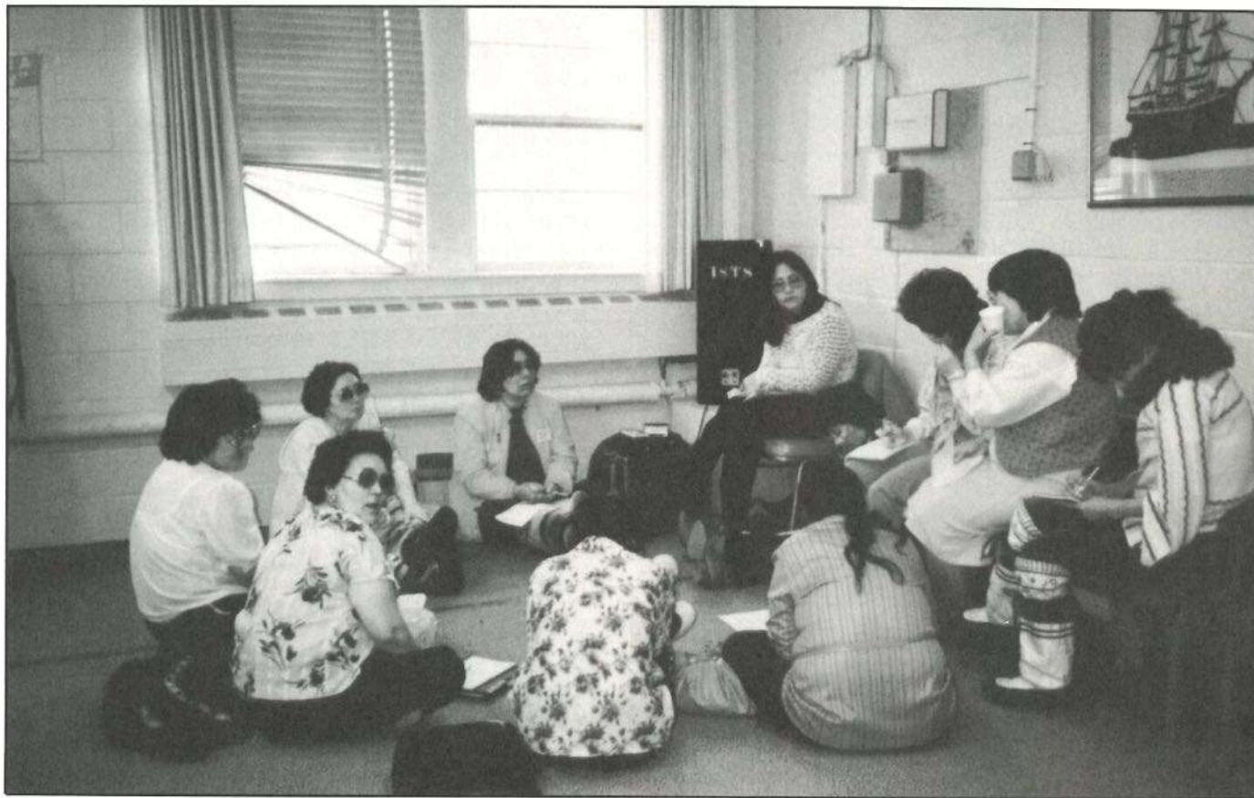
P^{\circ} \subset F D^{\circ} \Delta A^b / L \leq \sigma b N L P^{\circ} \rightarrow P^{\circ} L .