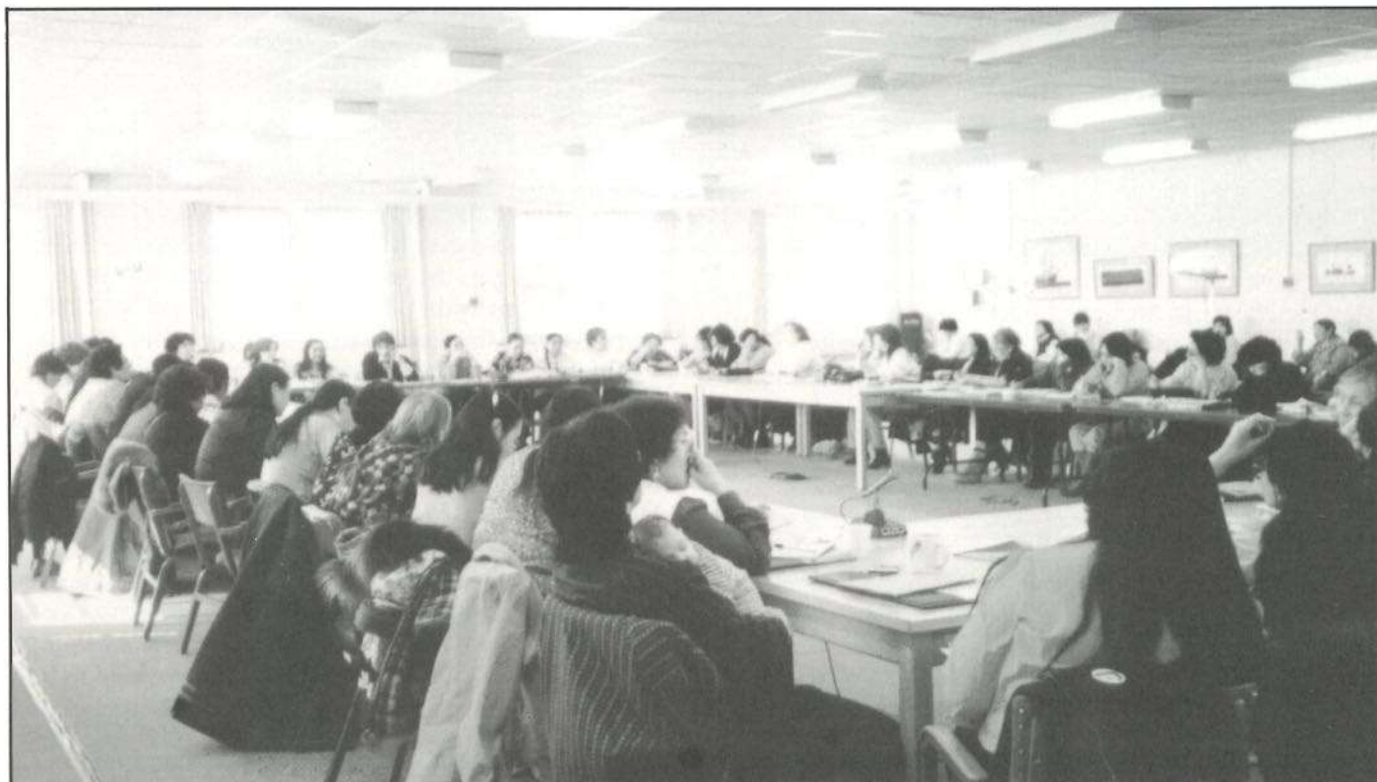
The delegation met at the Memorial University of Newfoundland.