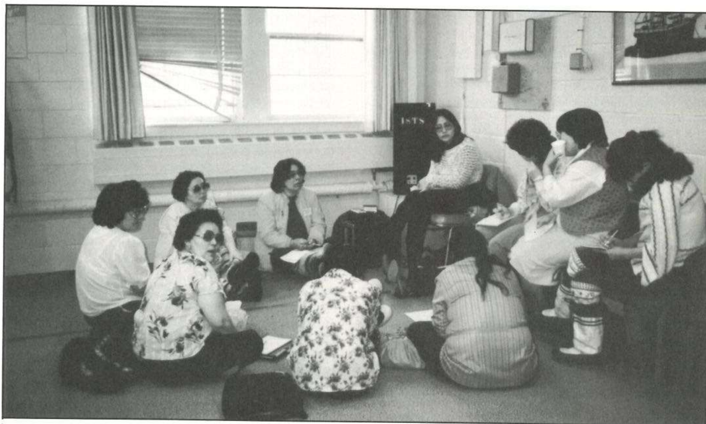
A Keewatin Regional Workshop in progress.

There was also a major concern about women being sent out of the Keewatin to Churchill, Manitoba to have their babies. Delegates commented on the fact that women rarely have their children in the community anymore. This situation should be changed so that health services are delivered on a local basis. It was suggested that traditional birthing methods be revived and home births encouraged.