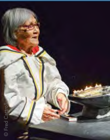
TRC Virtual Quilt Launch March 2013