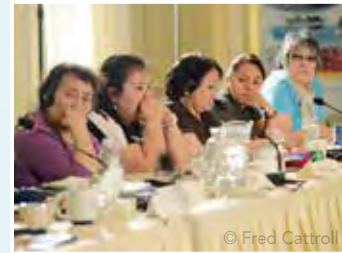
Annual General Meeting 2013 in Ottawa.