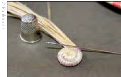
Thimble and grasswork, Rigolet, Nunatsiavut

The project included production of a video documentary, a photo album of the final art pieces, and an online 'virtual quilt' that will serve as a lasting