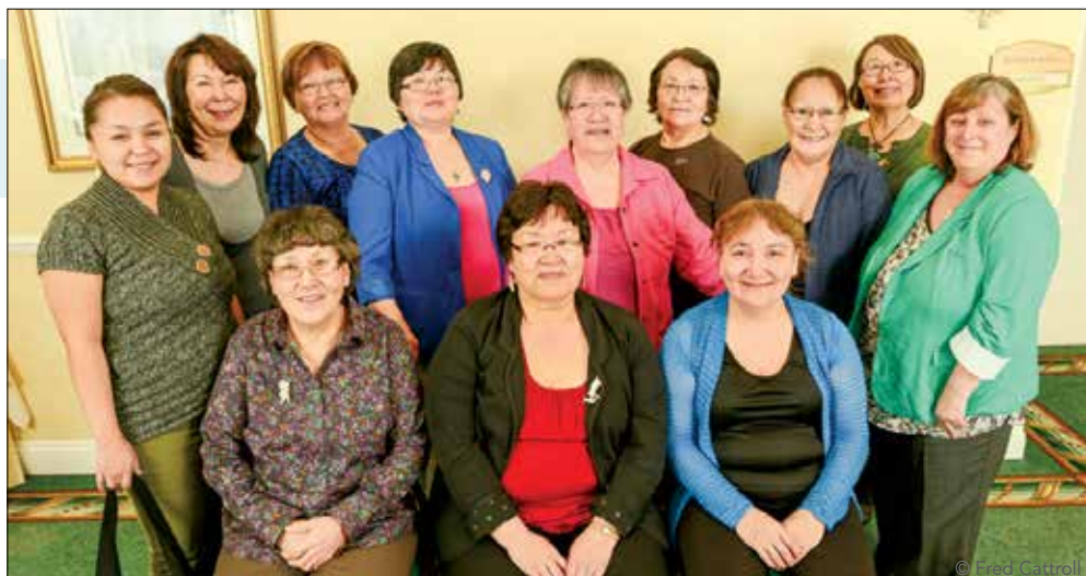
Pauktuutit Board of Directors March 2013

The IWBN has exceeded all hopes for its success. The pilot project is guided by an advisory committee of business women and funding organizations across Nunavut. The project was intended to develop a model for a support