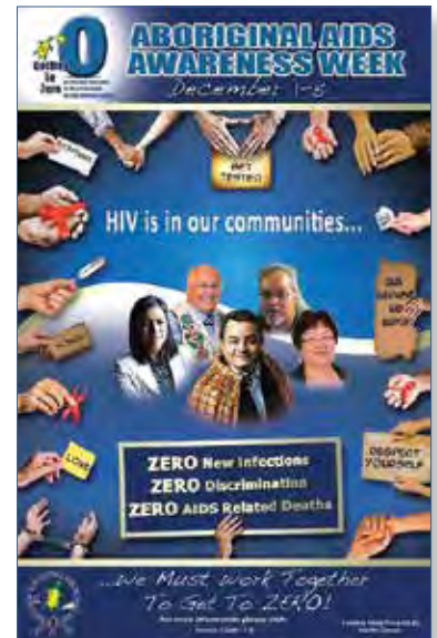
2013 CAAN Poster

Pauktuutit also sits on the Society of Obstetricians and Gynecologists of Canada’s Aboriginal Health Initiative Committee. This is particularly important as all aspects of women’s health are discussed at this table. This gives us an opportunity to ensure Inuit women’s issues are included.