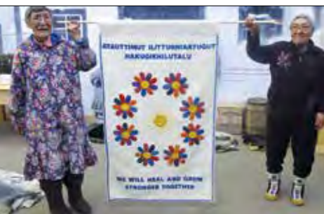
Cambridge Bay, NU