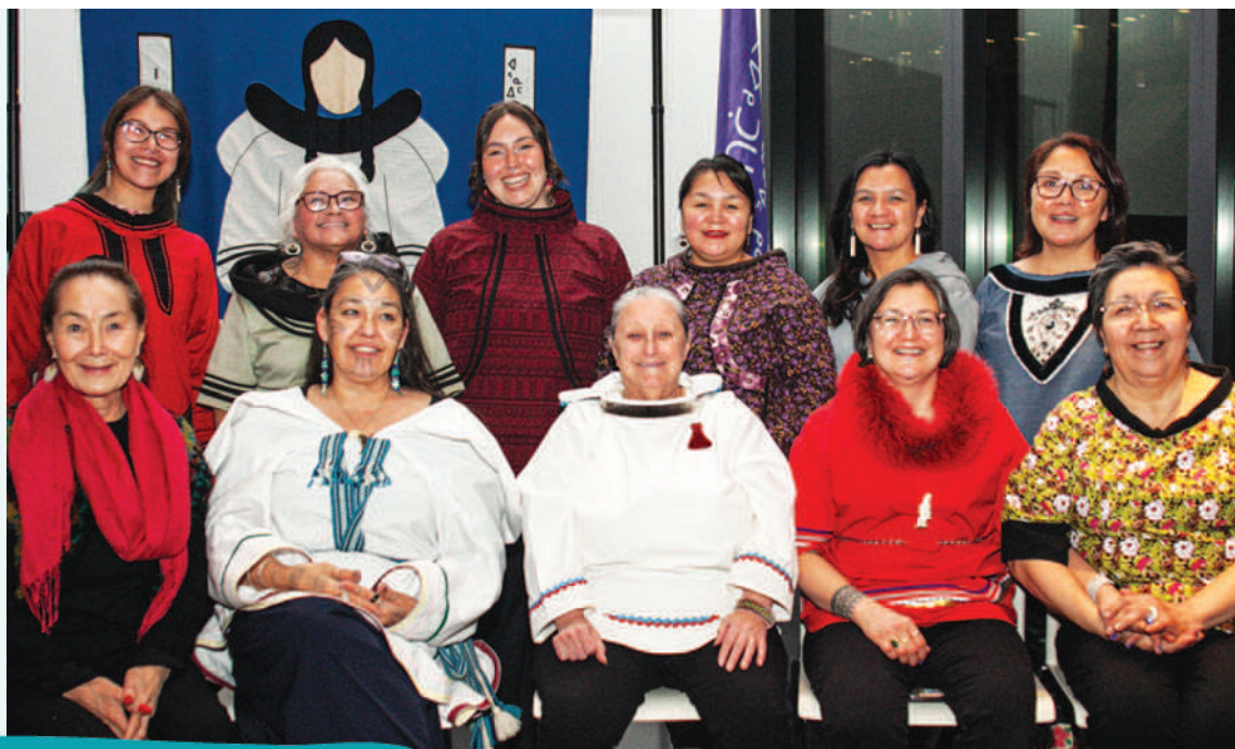
Board members at the 2023 Annual General Meeting.