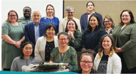
Pauktuutit and ITK youth representatives, along with Inuit regional representatives, at Health Canada's Expert Panel Review for Cannabis Legislation.