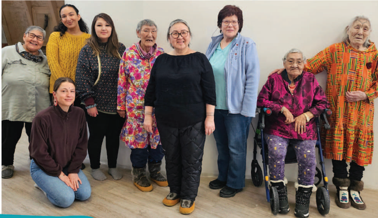
Inuit Women in Business workshop focussing on business start-up and expansion.