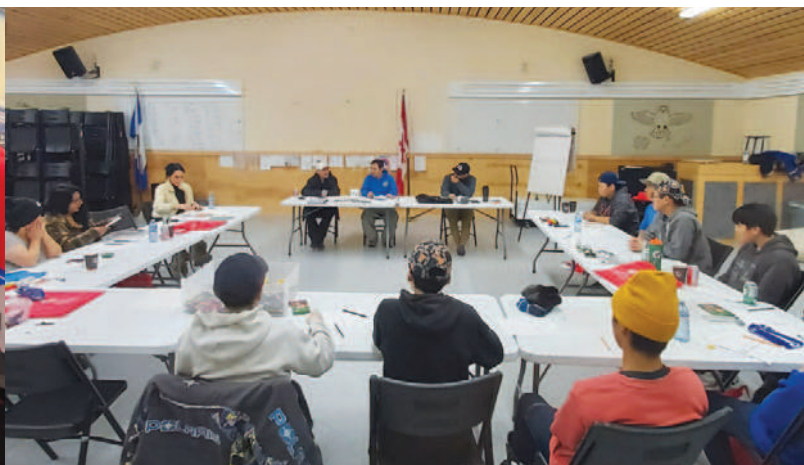
Red Amautiit displayed at the Nunavut Legislative Assembly; Ajuqiqtuq Parenting Life Skills Workshop with men and boys in Ulukhaktok, NWT.