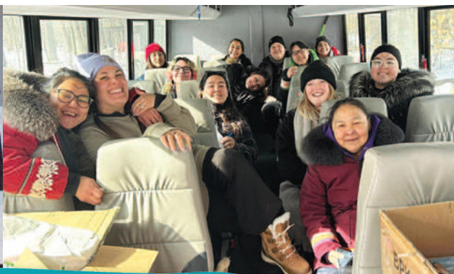
Engagements held in Yellowknife with Inuit youth and service providers on sexual health; Check Up Project – land-based culture and arts retreat.