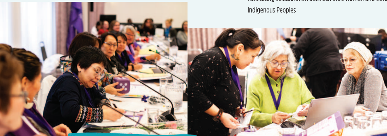
Staff and board members at the 2023 Annual General Meeting.