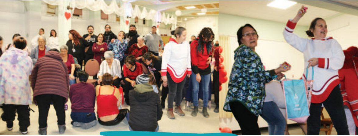
Staff, Board and Community members at the 40th Anniversary Celebrations.

Collaboration with government counterparts has strengthened our advocacy efforts. Working closely with various governmental agencies, we aligned our communication strategies and maximized the impact of our joint initiatives, advancing our policy goals and securing support for our programs.