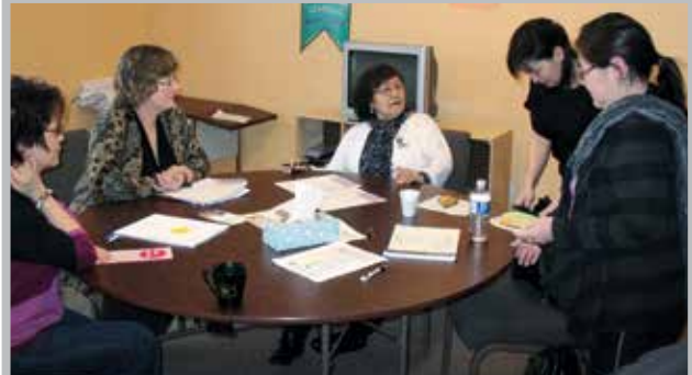
Tukisiviit: Do You Understand? Workshop Goose Bay Feb 2 2012