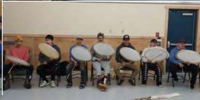
Pauktuutit hosted a workshop to engage young men and boys in discussions about managing emotions, healthy coping skills, self-worth, self-respect and self-esteem.