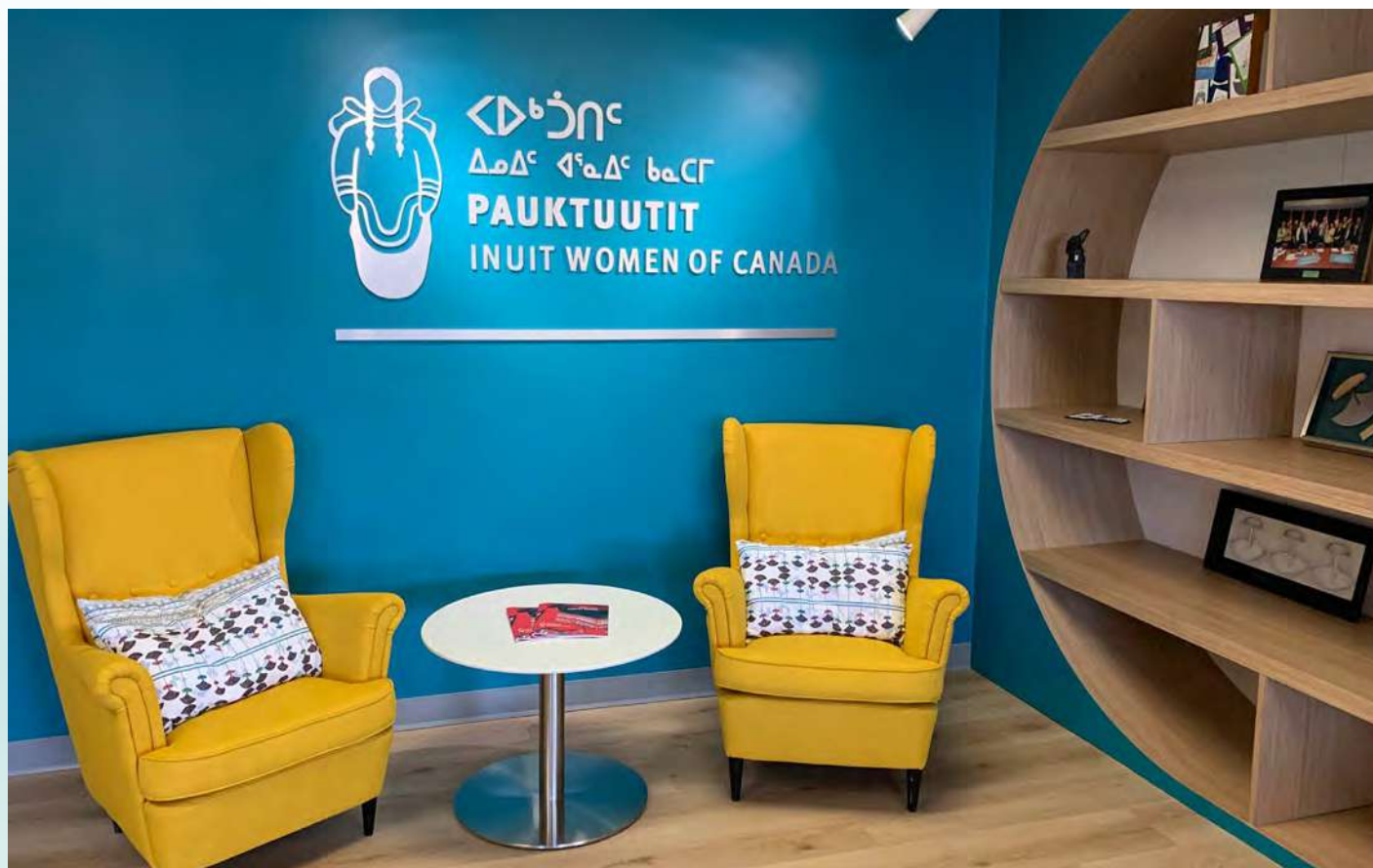
Pauktuutit's new office at 350 Sparks Street, Ottawa.

As we celebrate this milestone and look toward the future, we reaffirm our commitment to empowering Inuit women, children, and gender-diverse individuals. Together, we can continue to make a meaningful difference in our communities and beyond.