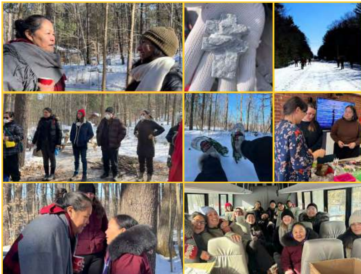
Pauktuutit hosted a land, culture, and arts retreat for Montrealmiut in Oka National Park.