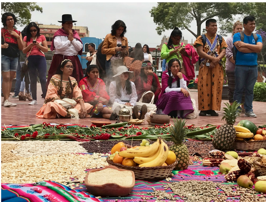
An offering and a cleansing in the public plaza of Barranco, Lima during the meeting for a discussion of the United Nations Permanent Forum

We also participated in a two-day National Inuit Suicide Prevention Strategy (NISPS) working group meeting in Inuvik in early December. At the meeting – chaired by ITK and hosted by the Inuvialuit Regional Corporation – discussions focused on the outcomes of the Prevention of Child Sexual Abuse Forum held the previous month and outlining next steps for a follow-up meeting. We also learned more about the Inuit Health Survey and how we can contribute to it, as well as development of future NISPS funding and implementation strategies for 2019 and beyond. Pauktuutit is now a voting member of the working group and are looking forward to actively engaging with the regions on this initiative.